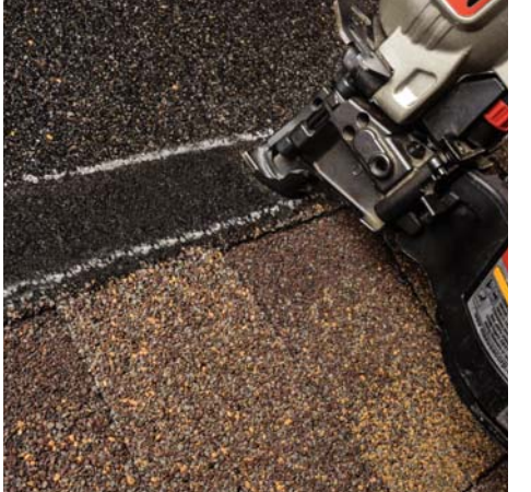
LayerLock<sup>™</sup> Technology Powers the industry's widest nailing zone